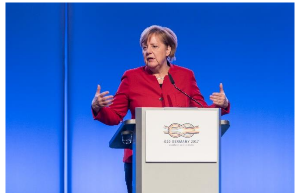
Federal Chancellor of the Republic of Germany Angela Merkel

She continued by explaining the motto of the German G20 presidency “Shaping an Interconnected World.” “An interconnected world should not be shaped haphazardly, but needs to be designed to build resilience, improve sustainability, and assume responsibility,” also acknowledging the motto of the B20 Summit. She emphasized that simply stating intentions was not enough and words had to be followed up with action. Therefore, she thanked the Business20 community for working out recommendations to the G20, which she found to be very valuable because of her trust in businesses to shape globalization. At the same time she called upon the business community to play its part in ensuring inclusive, future-oriented economic growth and development.