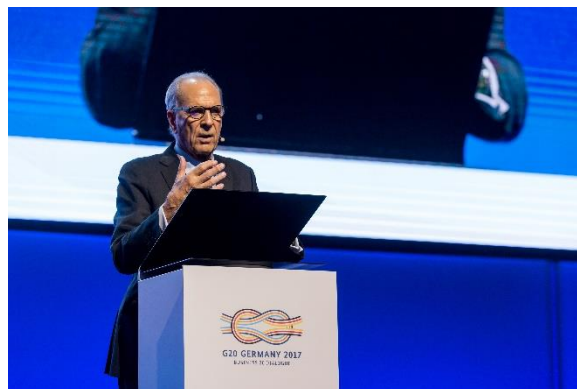
B20 Chair Jürgen Heraeus

around the world, the rules-based international trading system is increasingly questioned. While it was wrong to scapegoat trade for increasing inequality in many countries, international trade and the wider process of globalization need to better serve the most vulnerable parts of our societies, Heraeus emphasized.