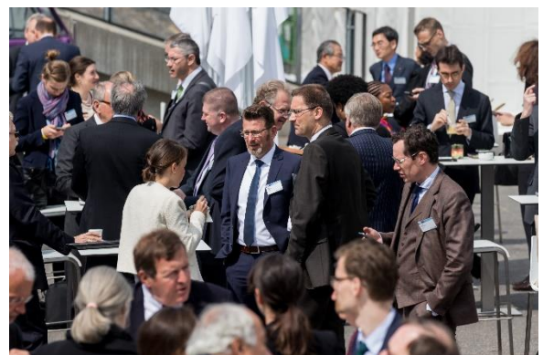
Outside area of the Tempodrom during the networking session