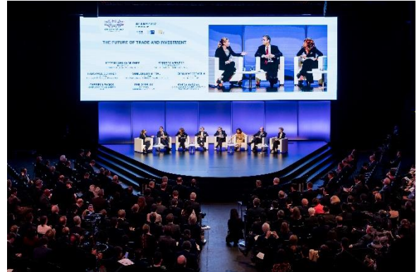
Panel on "The Future of Trade and Investment"