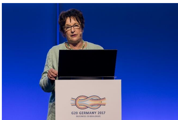
German Federal Minister for Economic Affairs and Energy Brigitte Zypries

next three years, this digital gender divide could increase by a further 100 million if nothing was done to counteract this trend.