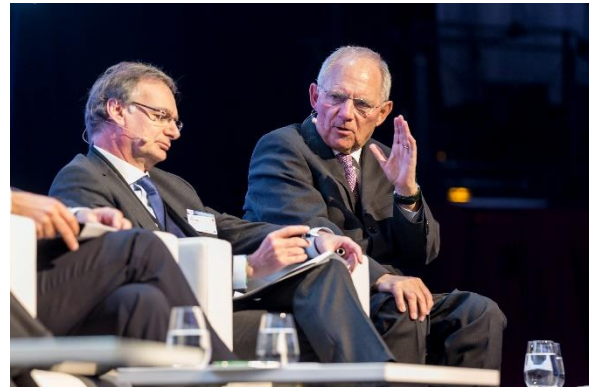
Pierre Nanterme, CEO Accenture, with German Federal Minister of Finance, Wolfgang Schäuble