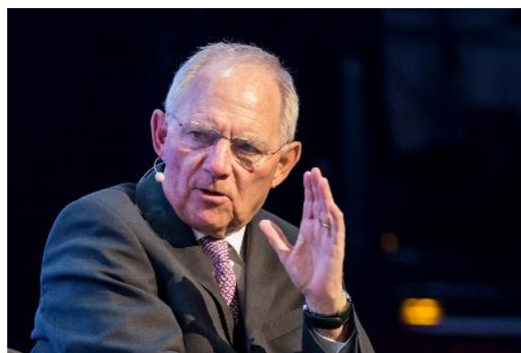
German Federal Minister of Finance Wolfgang Schäuble

high public and private debt levels, and to return to a post-crisis monetary policy. Additionally, all states needed reliable framework conditions to foster investment, Africa being a clear priority under the German G20 presidency. The Finance Minister called on the private sector to join governments to bridge the immense infrastructure investment gap on the African continent, which stands as a massive bottleneck for growth. While a full embrace of digital innovation in finance involved great opportunities to advance financial inclusion, its effects on financial stability needed to be monitored, the Minister underlined.