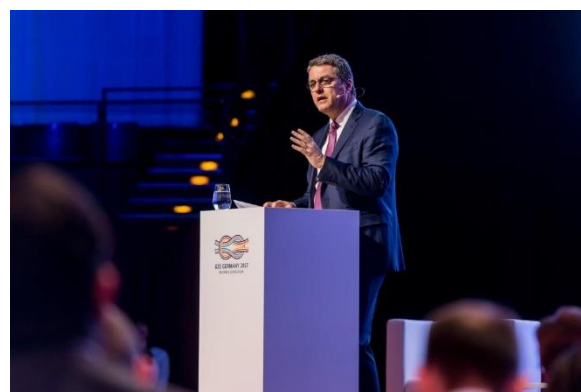
Roberto Azevêdo, Director General, WTO

Mr. Azevêdo used the recent experience of the global financial crisis in 2008 as an example for the important contribution of the institutional framework of the WTO, which is largely responsible for the fact that we did not see a return to protectionism akin to the destructive policies of the 1930s. Although WTO member states are right to demand further change, the Director General pointed to recent successes, such as the WTO's Trade Facilitation Agreement, as an indicator that the institution now stands ready to leave the gridlock of the past behind. For this, the engagement of the private sector was essential.