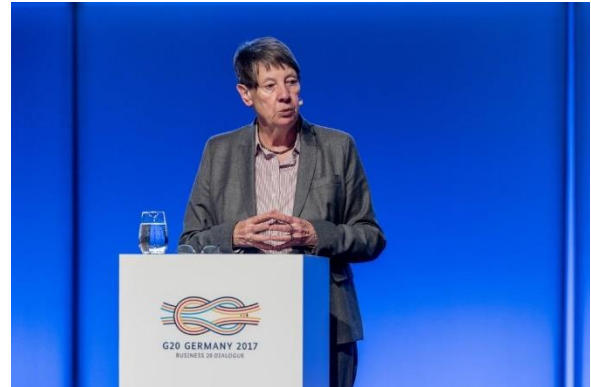
Barbara Hendricks, German Federal Minister for the Environment, Nature Conservation, Building and Nuclear Safety

green technology, and highlighted how the transition to green energy could foster inclusive growth and development.