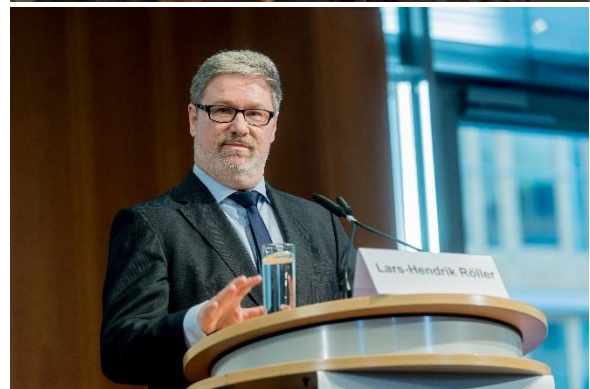
Top: Federal Minister of Finance Wolfgang Schäuble Below: G20 Sherpa Lars-Hendrick Röllner

Lars-Hendrik Röllner expressed the German government's appreciation for the cooperation between the business community and the official German G20 Presidency. The roadmap of the German G20 Presidency foresees numerous ministerial meetings in the run-up of the G20 summit which takes place on 7 and 8 July 2017 in Hamburg.