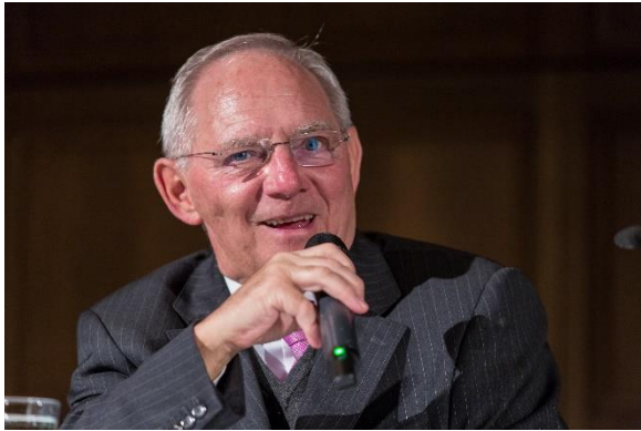
Wolfgang Schäuble, German Federal Minister of Finance